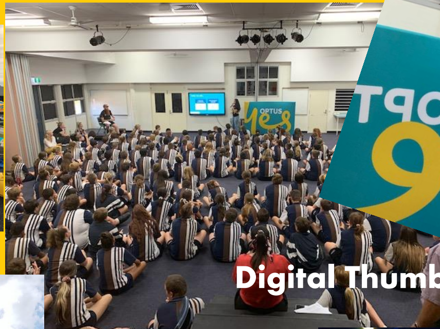
Digital Thumb Print