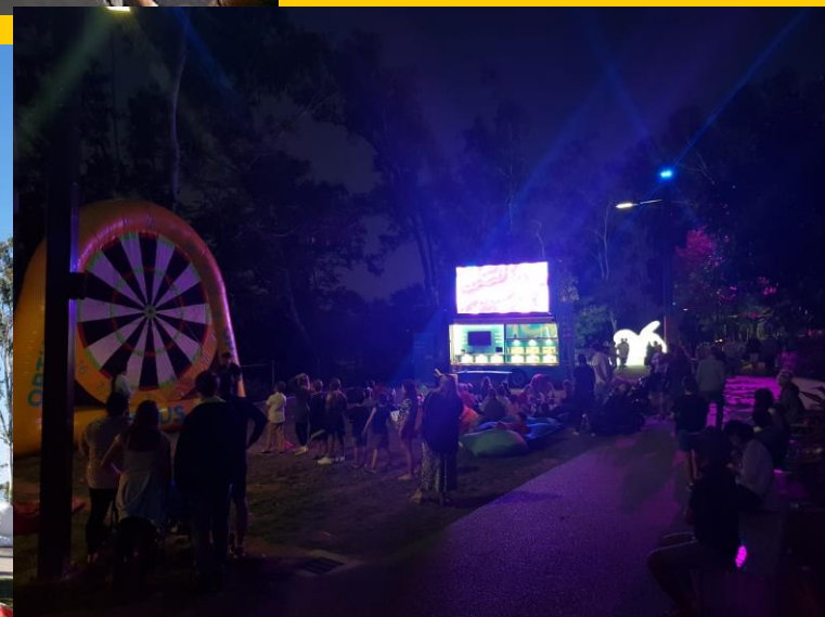
Rocky River Festival