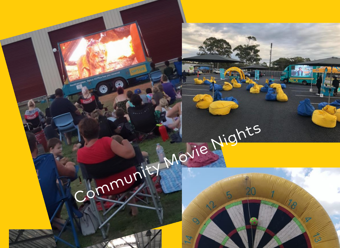
Community Movie Nights