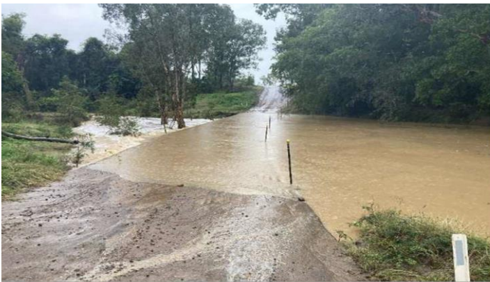
(Above) Stage 3A – Urban Operations Live Fire Facility West Access Road - Water over Stoodleigh Road causing delays to access in July