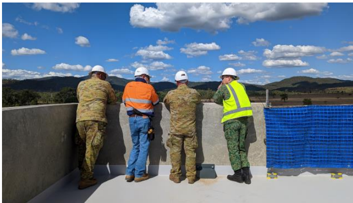
(Above) Representatives from Defence, Aurecon and Singapore Armed Forces viewing the High Explosive Impact Area from the rooftop of a non-live fire building, 13-14 Sep stakeholder progress walk

As at 09 September 2022, in Central Queensland 155 work packages have been awarded for the delivery phase design and construction work for the SWBTA, valued in the order of $537 million. Of these work packages, 115 will be performed by subcontractors with operations in the Central Queensland Region (including Rockhampton, Livingston Shire Council, Mackay, Moranbah, Emerald, and Gladstone areas). The work that will be performed by subcontractors with operations in the Central Queensland Region is valued in the order of $437 million.