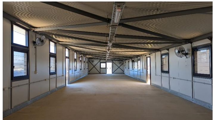
(Above) Stage 4 - Internal view of a permanent accommodation block