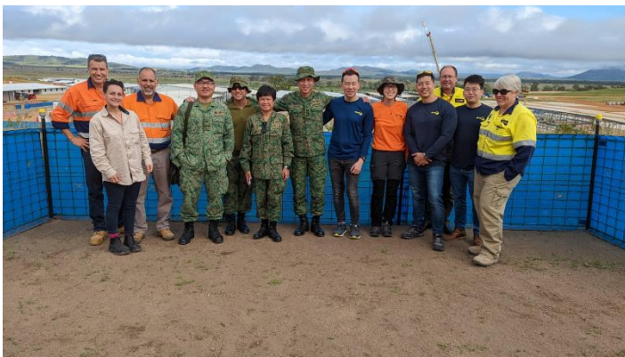
(Above) On 06 May, representatives from Aurecon, Defence, Singapore Armed Forces and Laing O’Rourke, took the opportunity to visit SWBTA before heading to Brisbane for a design meeting

Since release of the March Newsletter, two major construction milestones have been achieved, with development of the eastern CAALR (Precinct C) and western UOLF facility Access Road (Precinct A) completed in April and May respectively.