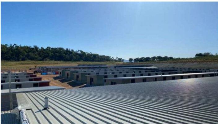
(Above) Stage 4 – Camp Accommodation