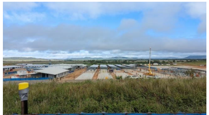
(Above) Overlooking the construction of Precinct B, from left: the exercise administration block, medical centre, ablution block, permanent accommodation blocks, and hardstands for temporary tent accommodation