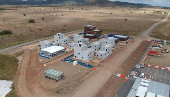
(Above) Stage 14 – Western Urban Operations Live Fire Facility construction works