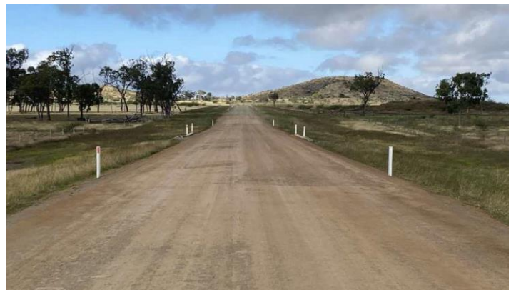
(Above) Stage 3A – Urban Operations Live Fire Facility West Access Road – Complete