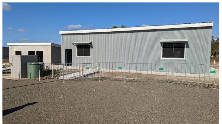
(Above) Stage 7 – Urban Operation Live Fire Facility – Communications Building and After Action Review building