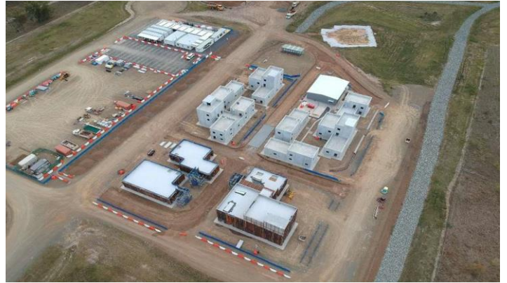
(Above) Stage 14 – Western Urban Operations Live Fire Facility construction works