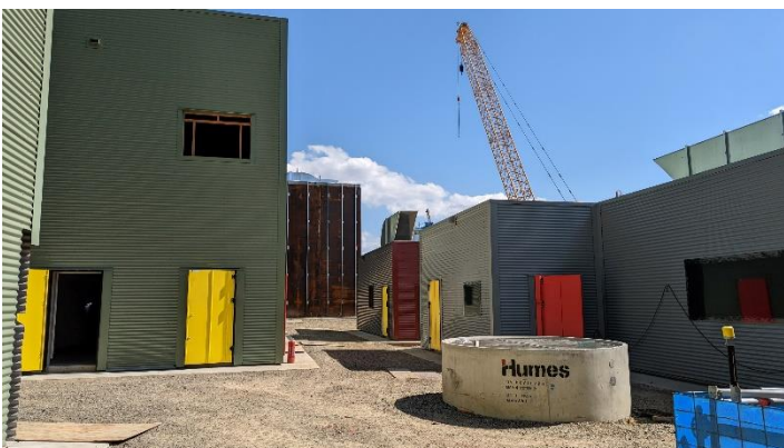
(Above) Stage 7 – Urban Operation Live Fire Facility structural works complete and façades continuing