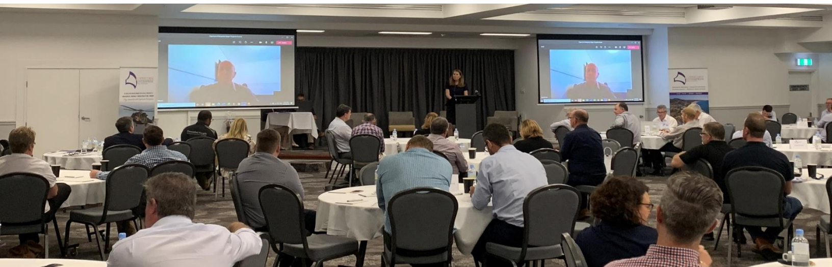
Photo: 2020 Major Projects Forum, Frenchville Sports Club

Our organisation is chartered to deliver a number of key services, including assisting with the facilitation of a strong, healthy and diverse local economy through Destination Marketing, Business Support, Visitor/Tourism Servicing and Investment Attraction.