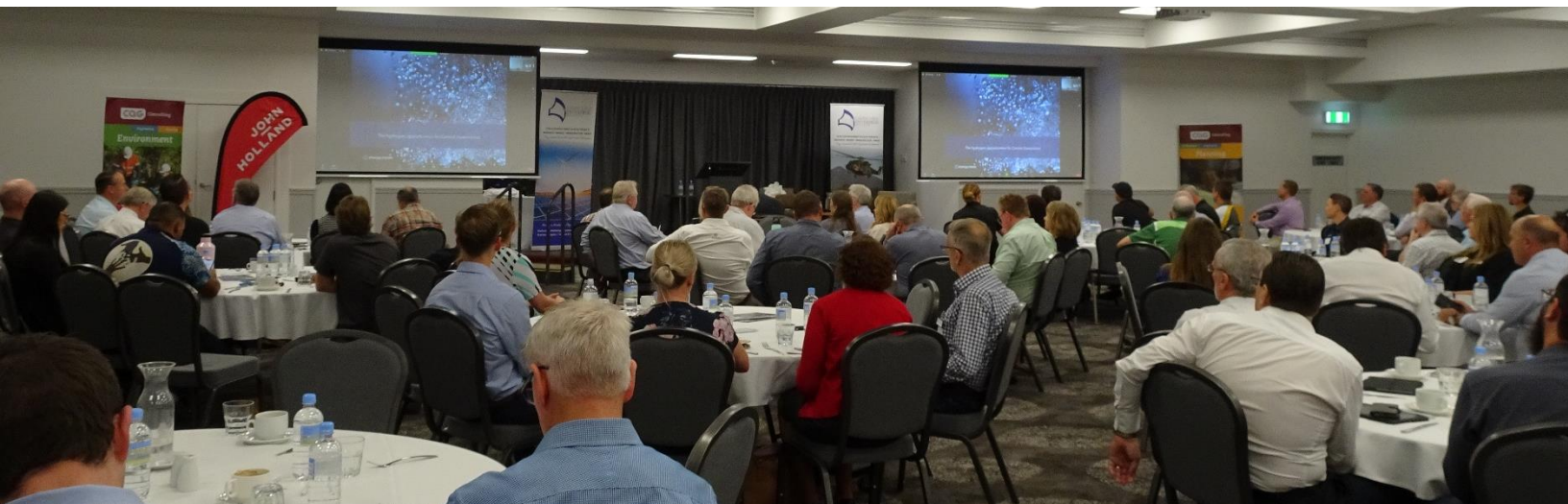
Photo: 2021 Major Projects Forum, Frenchville Sports Club

Our organisation is chartered to deliver a number of key services, including assisting with the facilitation of a strong, healthy and diverse local economy through Destination Marketing, Business Support, Visitor/Tourism Servicing and Investment Attraction.