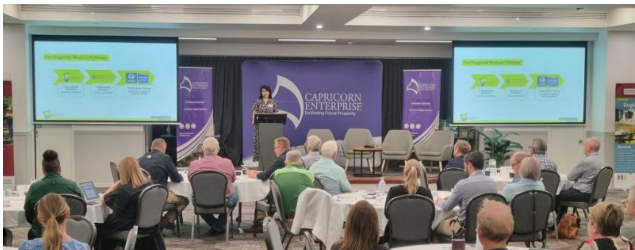
Photo: 2022 Major industry Forum, Frenchville Sports Club

Our organisation is chartered to deliver a number of key services, including assisting with the facilitation of a strong, healthy and diverse local economy through Destination Marketing, Business Support, Visitor/Tourism Servicing and Investment Attraction.