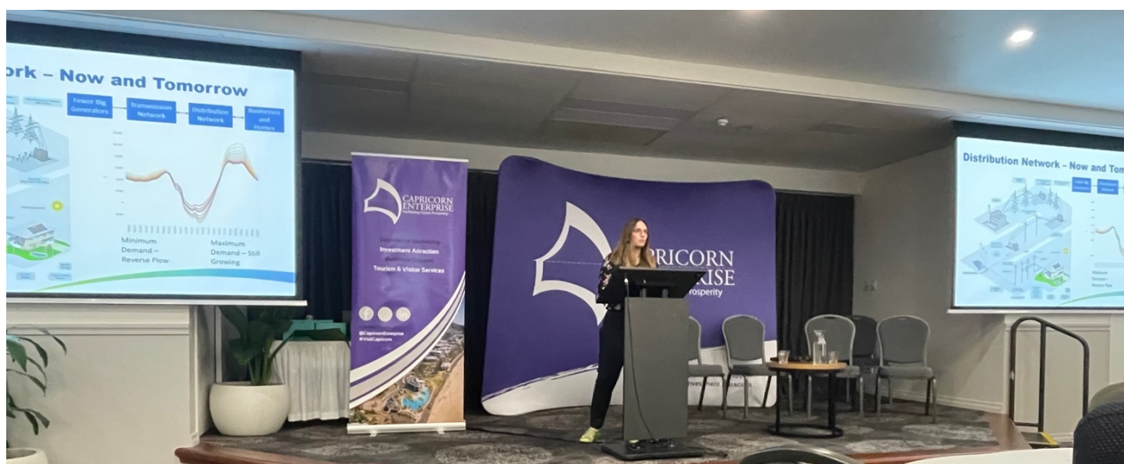
Photo: 2023 Major industry Forum, Frenchville Sports Club

Our organisation is chartered to deliver a number of key services, including assisting with the facilitation of a strong, healthy and diverse local economy through Destination Marketing, Business Support, Visitor/Tourism Servicing and Investment Attraction.